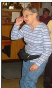
Dancing up a storm at the 2006 CSC in Kitchener Ontario

She says she loves Shuffleboard and still has lots of games left in her!